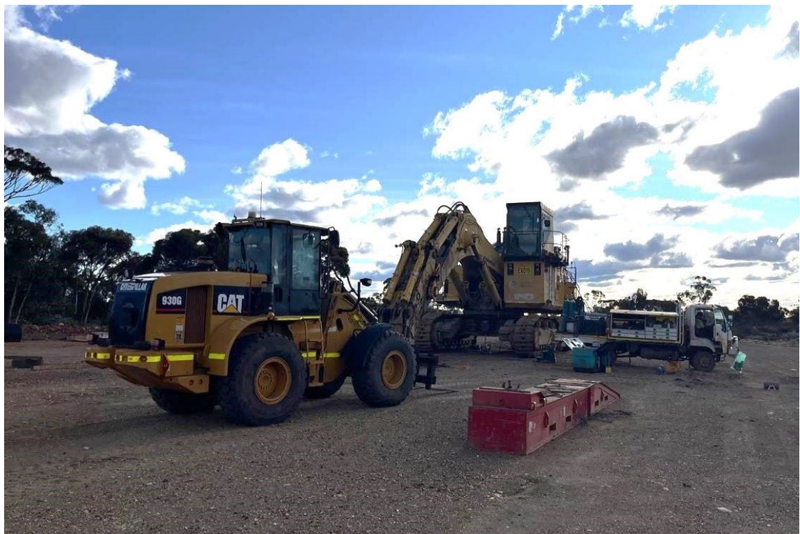
Figure 3: Reassembling the PC2000 excavator on site following transport