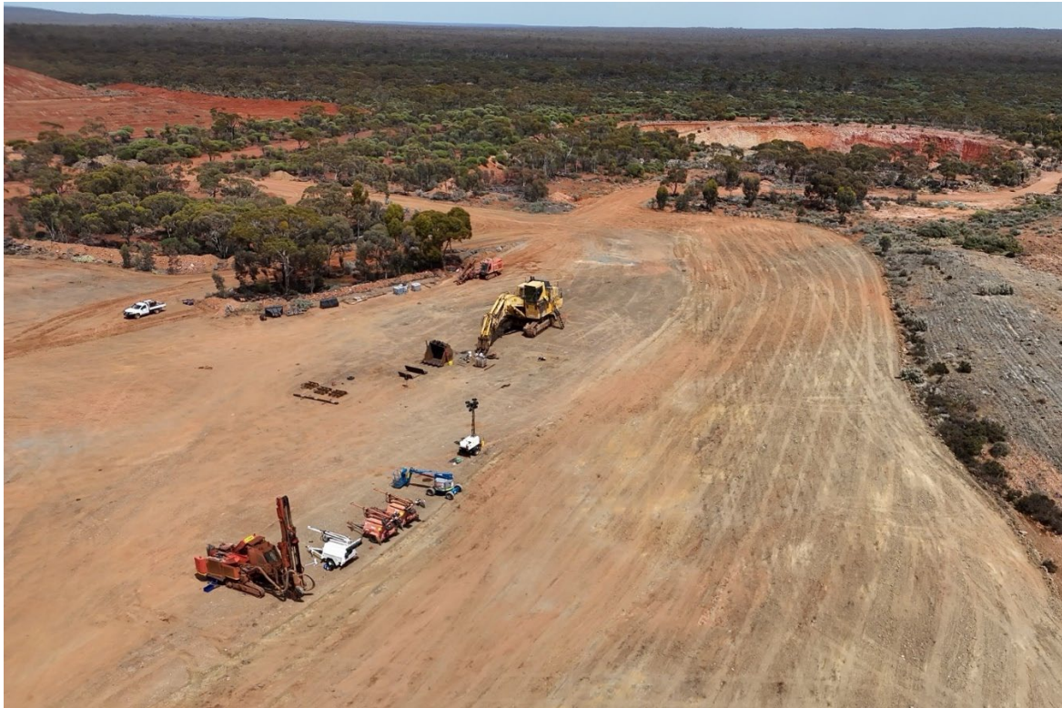
Figure 2: Aerial view of initial clearing and equipment mobilised to Phillips Find