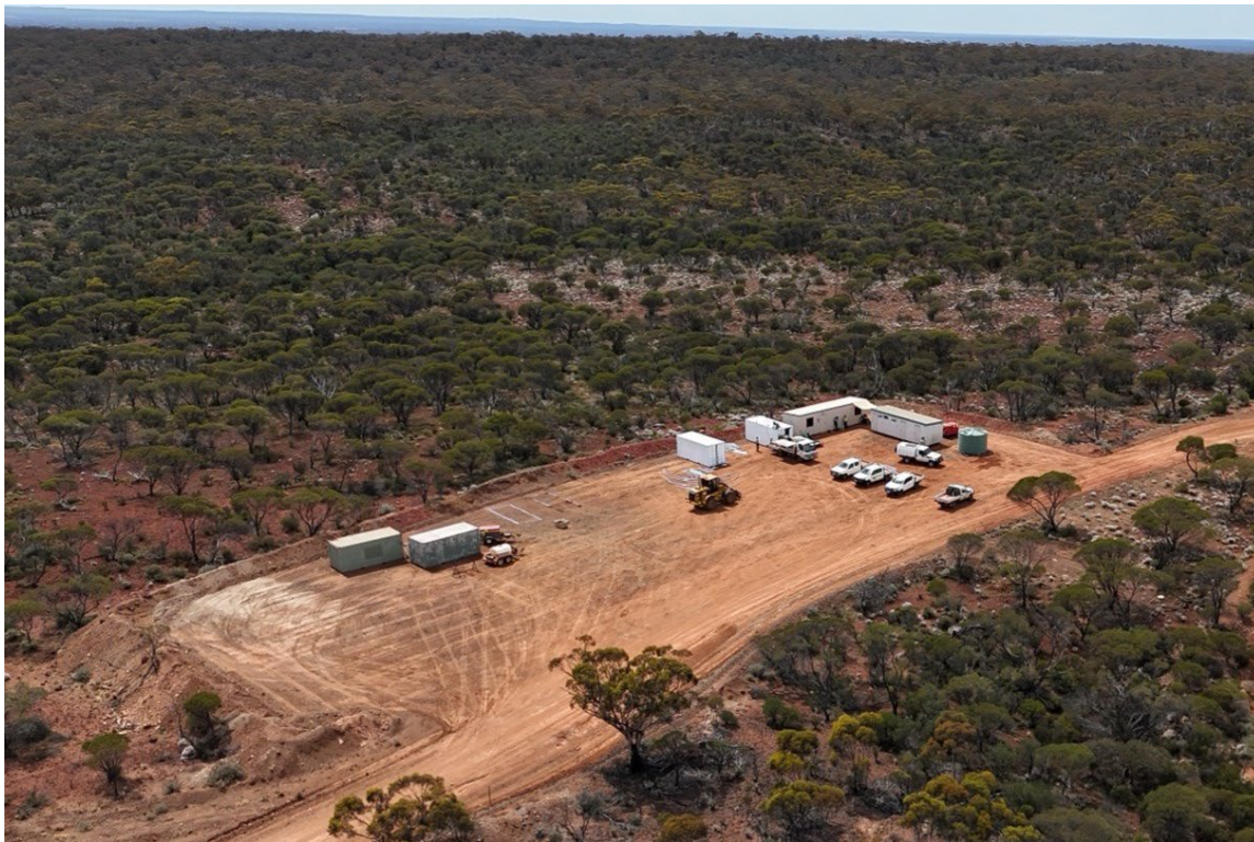
Figure 4: Aerial view of clearing and establishment of offices and workshop area