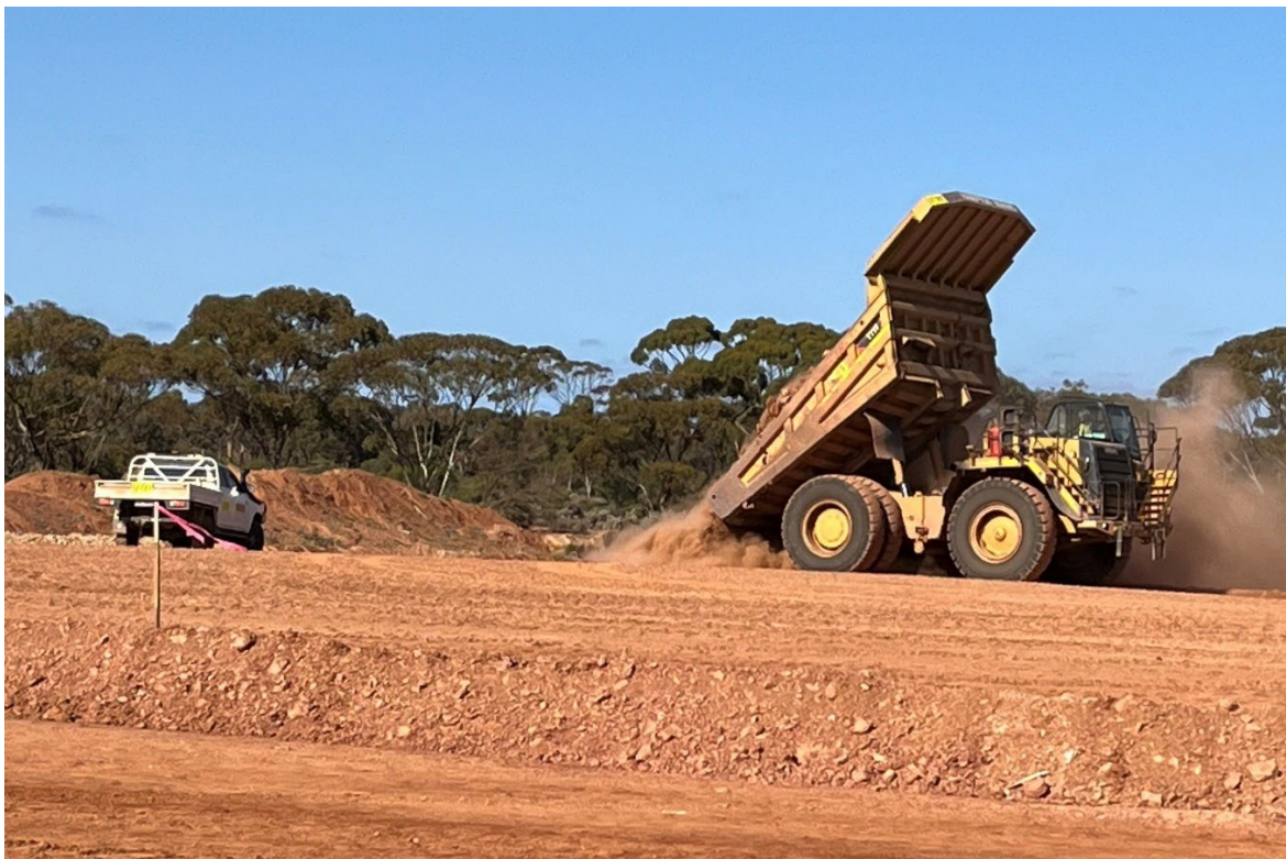
Figure 3: First ore on the Boorara ROM Pad