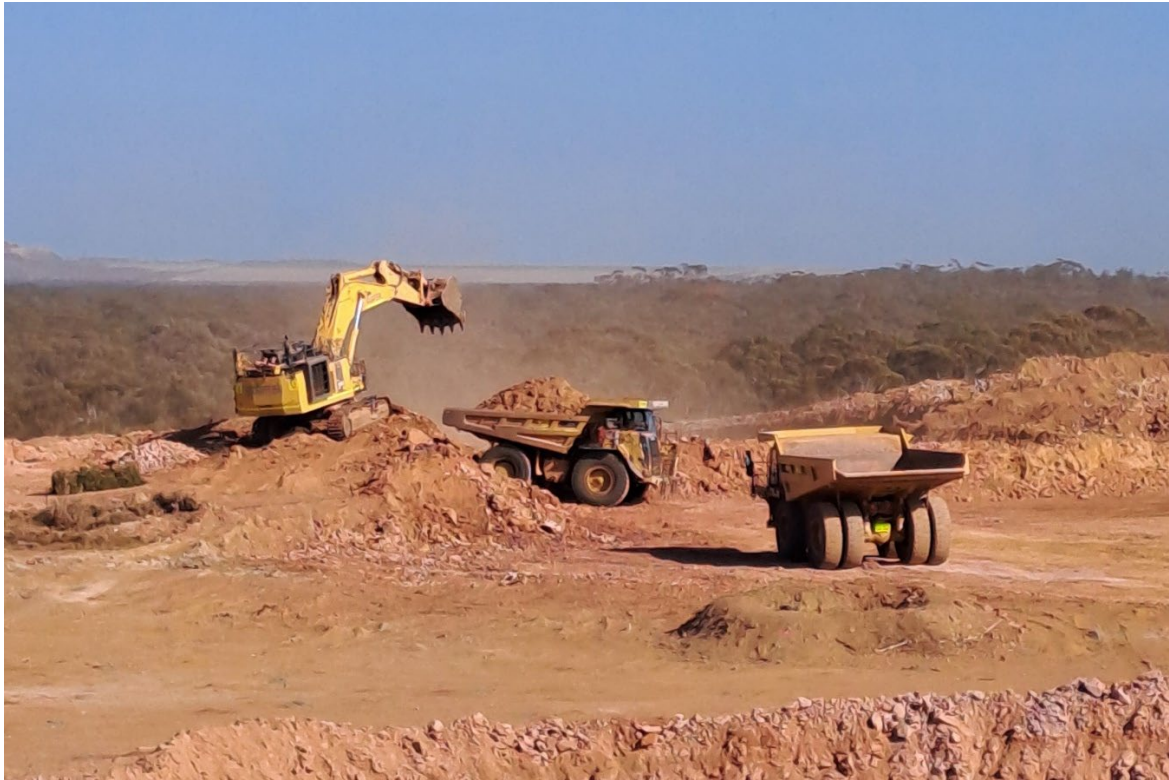
Figure 2: First ore being mined at Boorara in Pit 2 (Regal ore zone)