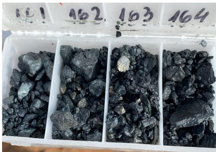
Figure 1: Sulphide mineralisation at Euston (CARC22008, 161m-164m)