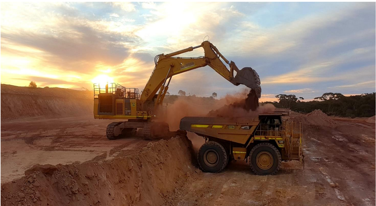
Figure 3: Mining progressing ahead of schedule in the Regal east open pit

First gold production and revenue is expected in July 2020 with production continuing on a campaign basis through to January 2021.