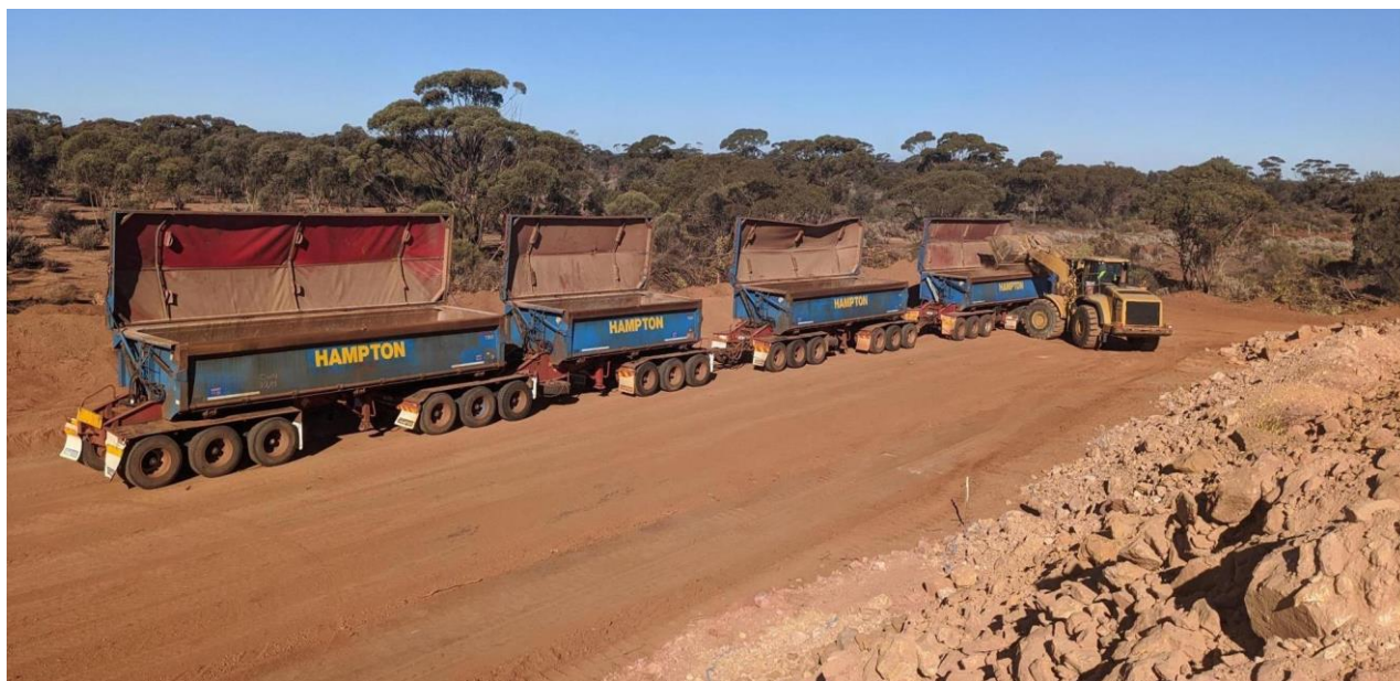
Figure 1: Ore haulage commences from Boorara gold mine to Lakewood Mill